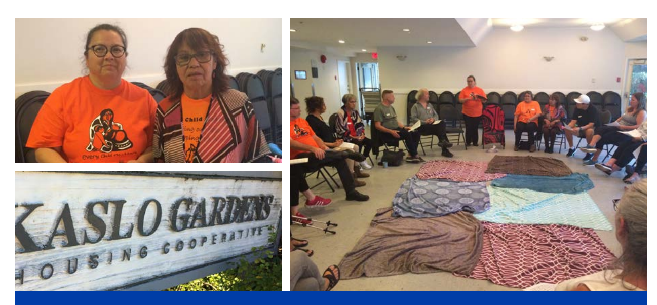
Kaslo Garden Housing Co-operative undertook a powerful Kairos blanket exercise as part of its reconciliation efforts.

Good Process: Kaslo Gardens partnered with Indigenous leaders to organize a Kairos blanket exercise, panel discussion and youth workshop. These events were opened to the larger co-operative community to engage co-ops in exploring policies and practices that could be employed within co-ops (such as social procurement of Indigenous services).