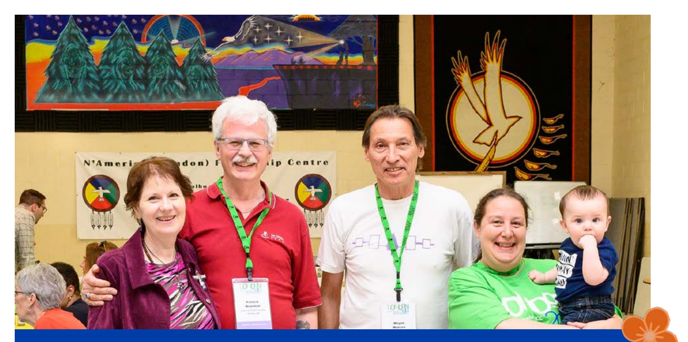
Members attend a dinner at the N'Amarind Friendship Centre in London, Ontario, during CHF Canada's 2019 Annual Meeting.